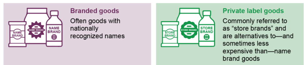
Figure 3: Product Types Sold in Department of Defense Commissaries and Exchanges

goods. Branded products are often products with nationally recognized names. Private label products are commonly referred to as “store brands” and are alternatives to—and generally less expensive than—branded products. (See figure 3.) Goods are called “direct import” when a company buys products directly from suppliers in another country, without using another person or organization to make arrangements for them.