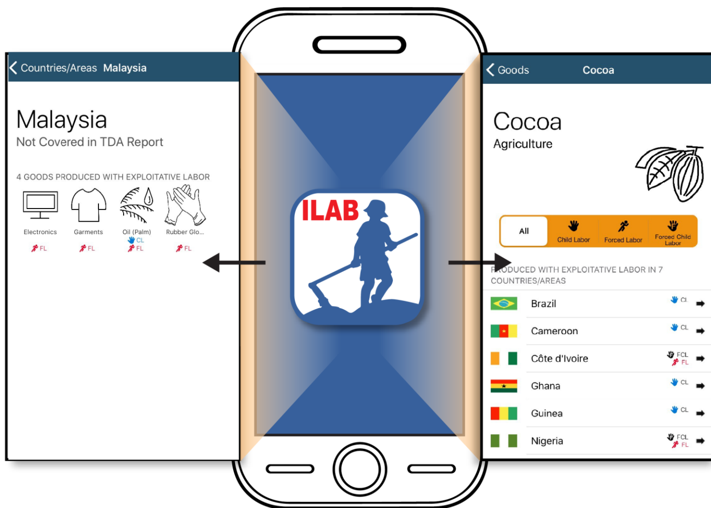
Figure 5: Department of Labor’s “Sweat and Toil: Child Labor, Forced Labor, and Human Trafficking Around the World” Mobile Application

GAO-22-105056