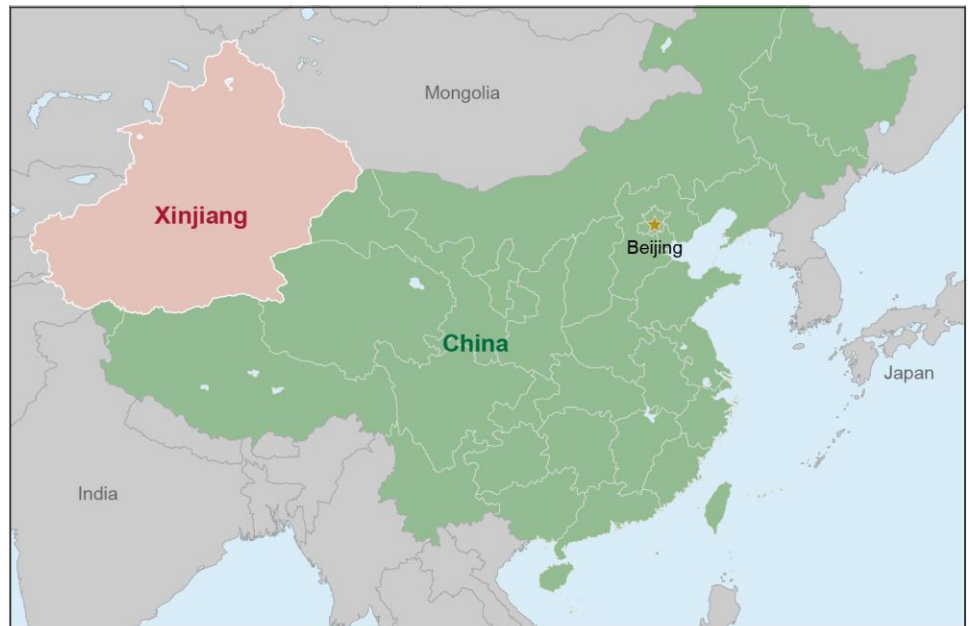
Figure 2: Map of China and Xinjiang Uyghur Autonomous Region

The U.S. government has found forced labor overseas in a variety of industries such as apparel, manufactured goods, electronics, and fishing, which produce goods that are or are likely to be imported into the United States. For example, Bangladesh’s garment sector has come under increased scrutiny due to reported substandard and unsafe factories, particularly following the 2013 Rana Plaza factory collapse, which killed more than 1,000 workers (see sidebar). Of more recent concern are Chinese factories and suppliers within and outside the Xinjiang Uyghur Autonomous region (hereafter referred to in this report as Xinjiang or the Xinjiang region), which are reportedly using Uyghur forced labor or employing former detainees under coercive conditions (see figure 2). Complex supply chains can impede traceability and make it challenging to verify that goods and services are free of forced labor. 11